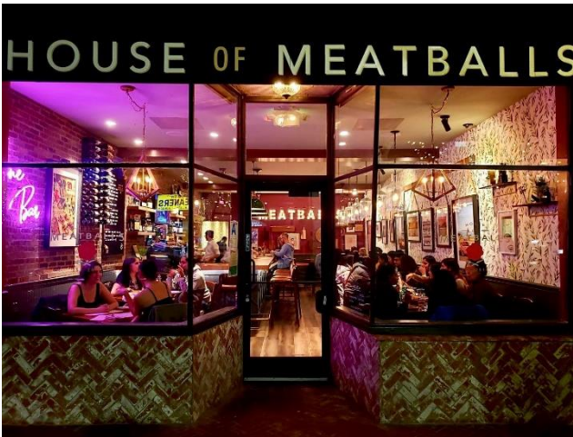
Exterior looking in