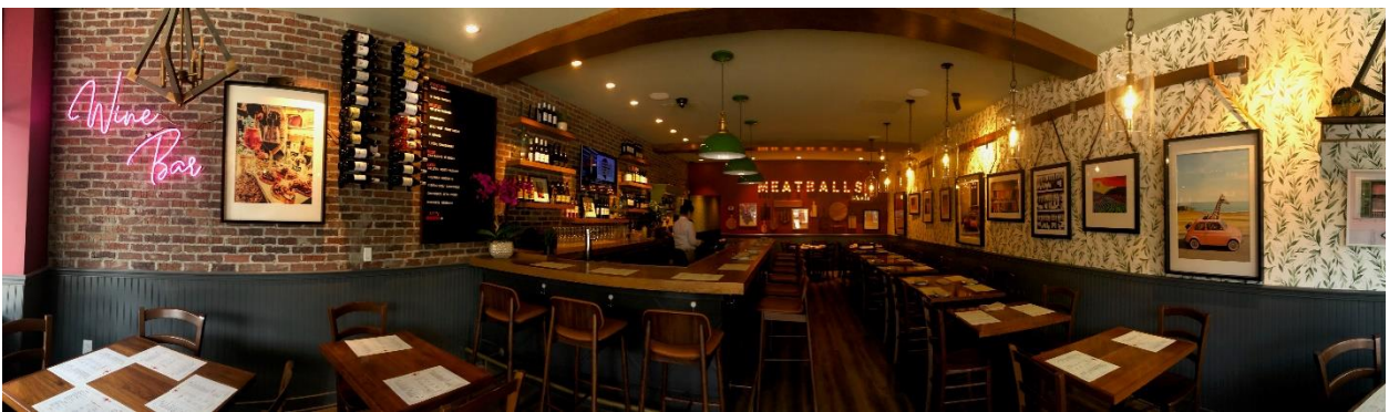
Panoramic of interior. Curvature of picture skews the bend of the restaurant