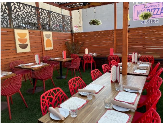
Back Patio (Reg Hours: Weds – Sun 5-9pm, unless for private event)